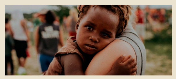
The partnership with The Circle will reach over 94,000 directly women over the coming year and 282,000 in the wider community.

The aim of the organisation is to prevent violence and promote the re-entry of women back into their communities through social acceptance and empowerment.